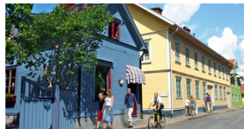
Stroll among the wooden houses from the 18th, 19th and 20th centuries that line Hjo's cobbled streets.