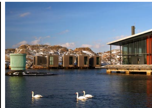
The Nordic Watercolour Museum in Skärhamn.