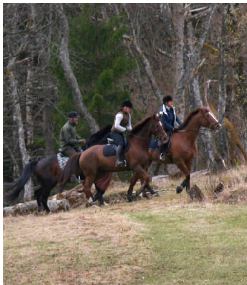
20% of Sweden's horses can be found in Västra Götaland – more than in any other region.