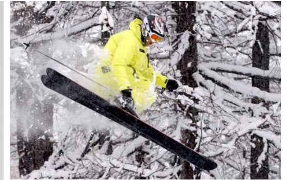
8848 Altitude designs and manufactures ski wear for the Scandinavian climate.