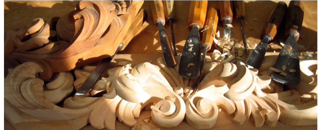
The Gustavian Room is an association of manufacturers of period furniture where they cooperate on product development.

T he manufacture of furniture and kitchens is another speciality of the west of Sweden. Tibro in Västra Götaland is one of Sweden's furniture centres and nowhere else in Scandinavia can so many furniture companies be found in the same place. Tibro has developed into a competence centre in wood technology. There are several successful producers in the area, ranging from makers of office furniture and kitchens to small, inventive design and handicraft companies.