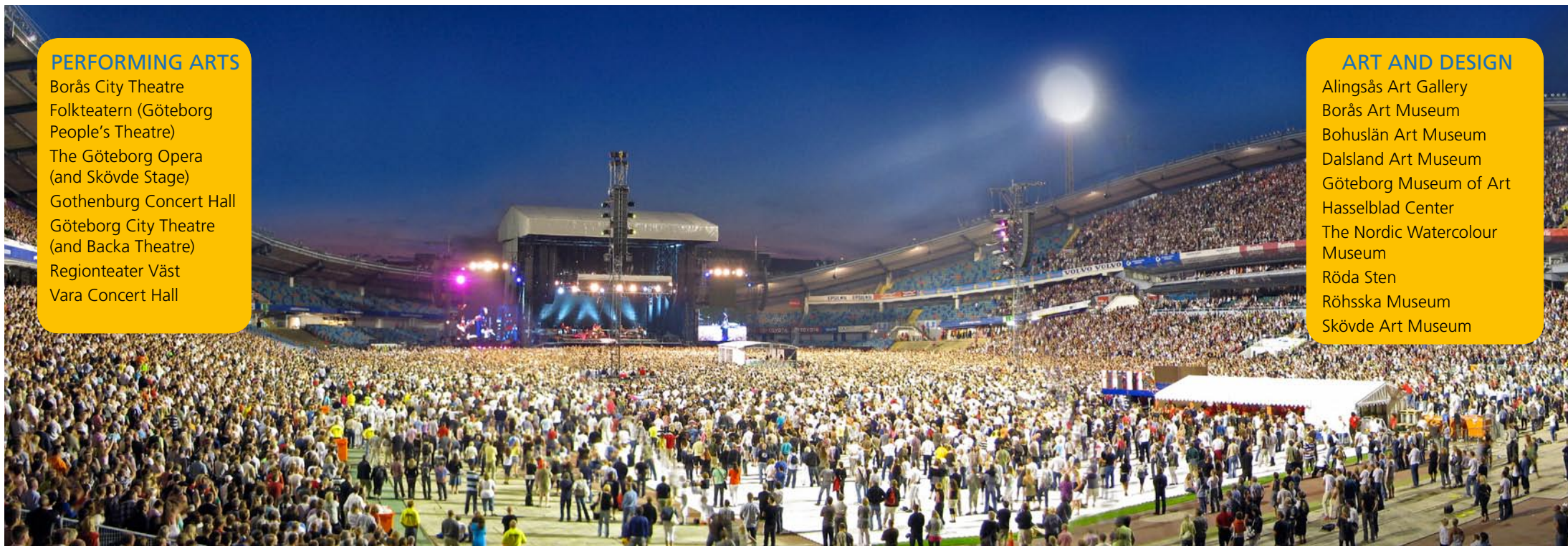
International stars meet their fans at Ullevi in Göteborg.

Alingsås Art Gallery Borås Art Museum Bohuslän Art Museum Dalsland Art Museum Göteborg Museum of Art Hasselblad Center The Nordic Watercolour Museum Röda Sten Röhsska Museum Skövde Art Museum