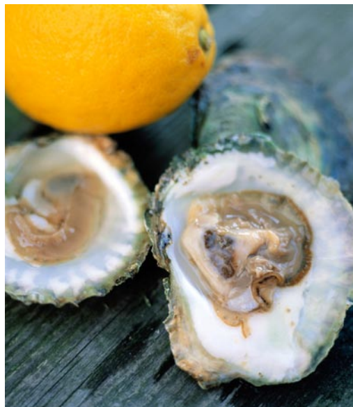
Sweden's first commercial oyster farm is located on the island of South Koster and has been built up in cooperation with marine biologists and French oyster farmers.