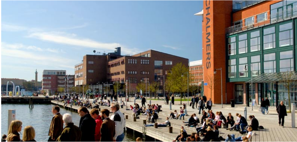
Lindholmen Science Park in Göteborg is a centre for knowledge and entrepreneurship in mobile communication, ITS and modern media industry.