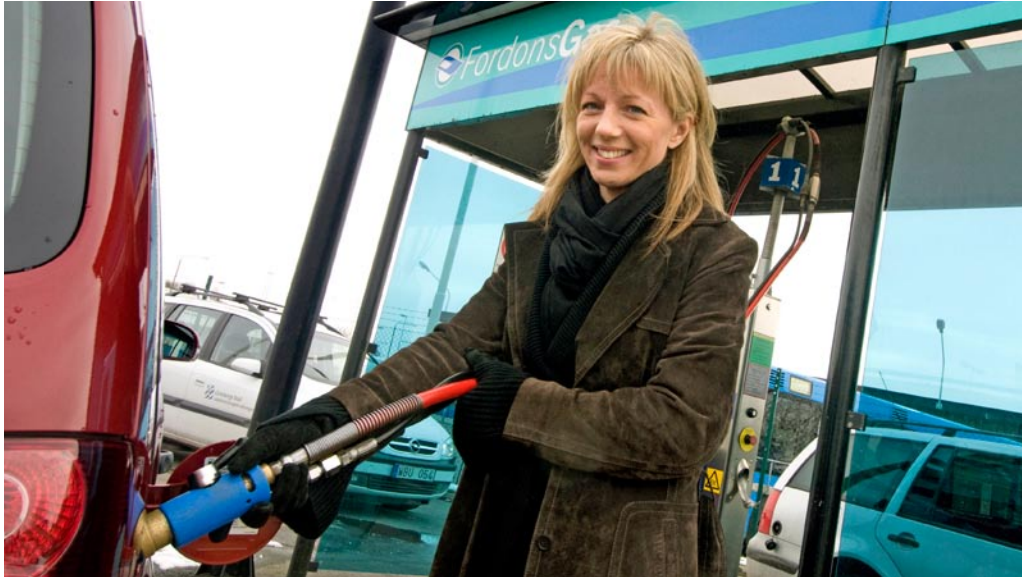
Västra Götaland has Sweden's best infrastructure for biogas with almost 45 filling stations and 10,000 gas-powered vehicles.

Västra Götaland is well advanced in the biogas field, an almost climate neutral high-grade fuel that is extracted from biological refuse and waste. Biogas Väst is a collaborative project to promote biogas as vehicle fuel. Some 30 actors in the whole biogas chain in Västra Götaland – fuel producers, municipalities, vehicle manufacturers and distributors – all collaborate to promote the biogas market. It is a cross-border partnership between private and public actors, an approach that has inspired more biogas partnerships around the world.