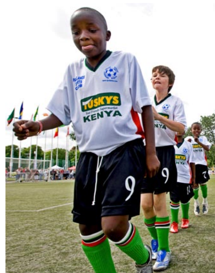
The world's biggest football tournament, Gothia Cup, held in Göteborg, brings together tens of thousands of young footballers from some 60 countries.

A journey through Västra Götaland often begins in Göteborg, Sweden's gateway to the world. A big city by the sea, renowned for its events and with an international buzz and lots of hospitality. Proximity defines the city's interaction with its residents and guests. Most things are within walking distance – the major hotels, the Svenska Mässan exhibition and congress centre and Liseberg, Scandinavia's largest amusement park. Göteborg is a green city and people interested in gardening often visit the Botanical Garden, one of the biggest of its kind in Europe, with guided tours and exhibitions the year round. The Garden Society