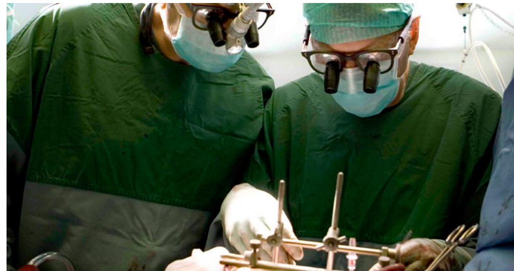
Approximately 1,700 heart operations are carried out at Sahlgrenska University Hospital in Göteborg every year. New methods mean that transplants can now be avoided in some cases.

Sahlgrenska Science Park, Göteborg – Life Science