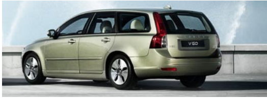
Volvo V50 DRIVE