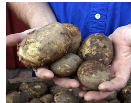
Lokalproducerat i Väst is an umbrella organisation for 200 small-scale food producers.

The restaurant sector is important for growth and quality of life. The West Sweden Tourist Board operates a development and quality programme for restaurant owners and producers of raw ingredients called a Taste of West Sweden. The intention is to further develop the well-reputed cuisine of west Sweden and enrich visitors with exceptional food experiences. Another important area of development is innovative food with unique characteristics – functional foods. The Food and Health Concept Centre (FHCC) builds bridges between researchers and food producers to promote product development and the commercialisation of research findings. Chalmers University of Technology has a Food Science division that conducts research into how health promoting food can be extracted from herring and other marine produce.