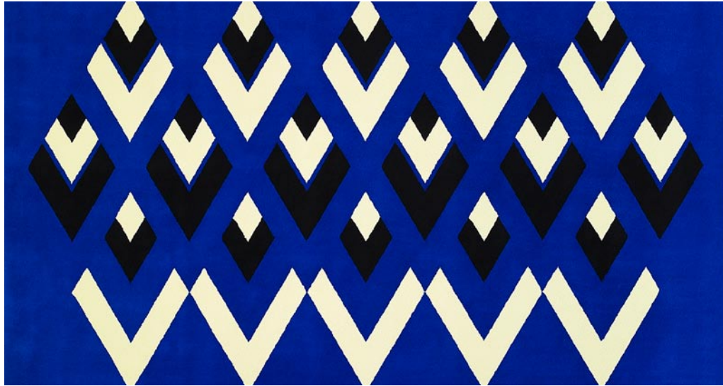
Kasthall has been designing and manufacturing woven and hand-tufted carpets since 1889.