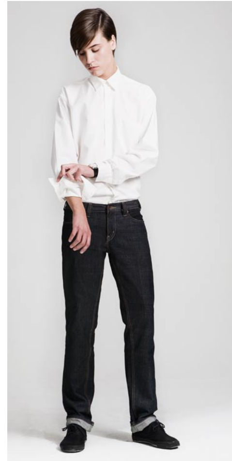
DEM Collective in Göteborg designs and produces ecological and fairtrade-labelled fashion.

T he area around Borås is Scandinavia's textile and mail order centre. Västra Götaland is home to some of Sweden's strongest brands and several innovative producers of ecological fashion. The Swedish School of Textiles in Borås conducts extensive research in textile technology. Smart textiles, that is textiles with technology built-in, is an area where Västra Götaland is a world-leader. They are a completely new kind of textiles that are revolutionising the textile industry and creating enormous business opportunities in such areas as medical engineering, interior decoration, vehicles and buildings. Smart Textile Prototype Labs in Borås is a full-scale laboratory that brings together researchers in areas as diverse as design, textile engineering, interaction design and nanofibre engineering.