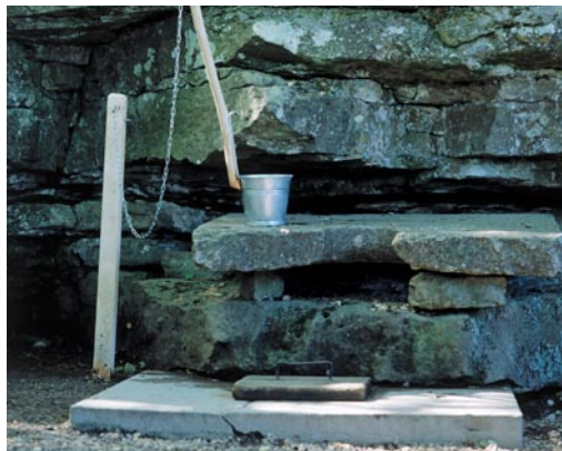
St. Sigfrid's Spring, close to Husaby church, was an important place of pilgrimage in the Middle Ages.