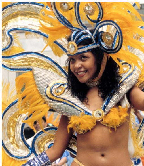
The Hammarkullen carnival in Göteborg attracts 50,000 visitors a year.