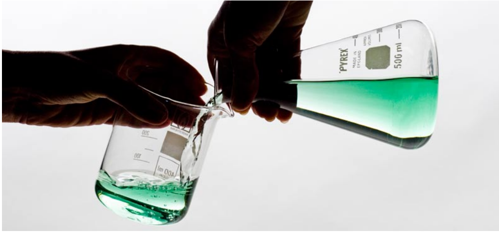
AstraZeneca in Mölndal created Losec and its successor Nexium for gastric and stomach ailments.