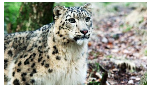
Nordens Ark in Bohuslän.