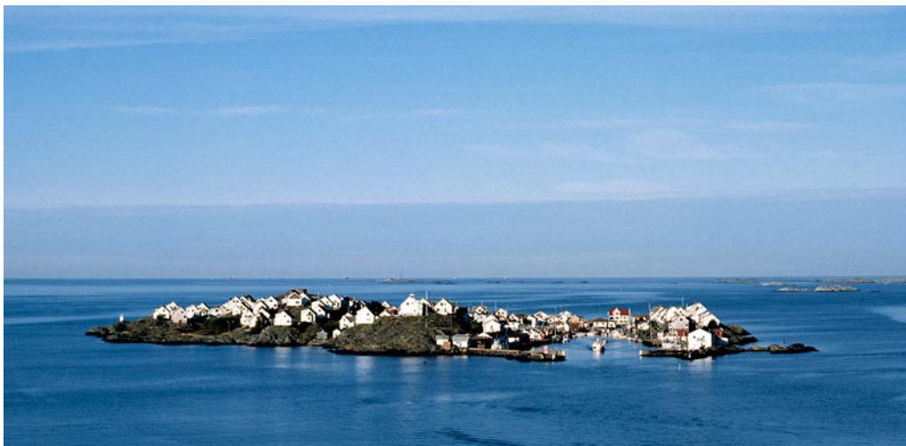
There are 29,611 islands in Västra Götaland, of which 153 are inhabited. Åstol in Bohuslän is one of them.