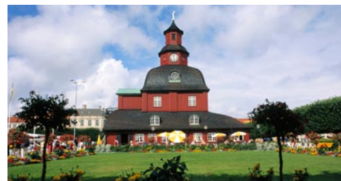
The old town hall in Lidköping was originally a nobleman's hunting lodge.