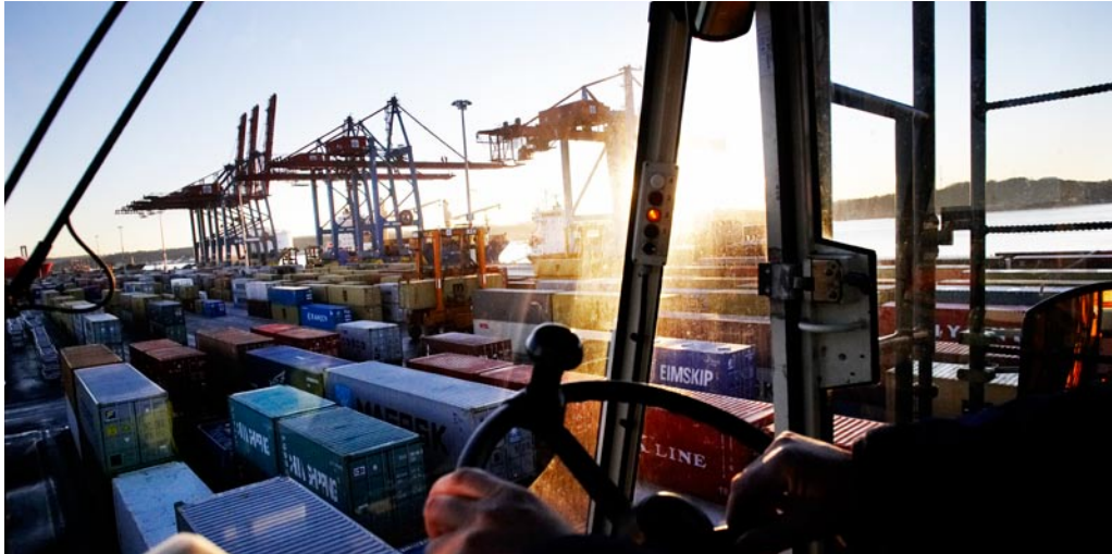
65% of Sweden's container traffic passes through the Port of Göteborg.