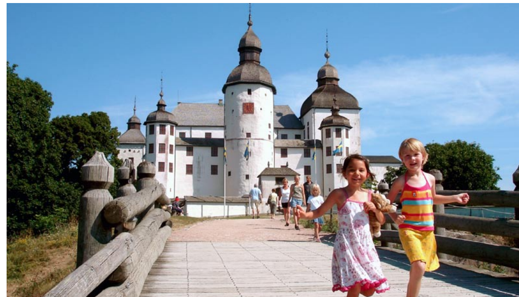
Not far from Lidköping on the shores of Lake Vänern lies 700-year old Läckö Castle. Visitors can enjoy both music and theatre performances during the summer. Newly laid out every year, Little Castle Garden is an experience in itself.