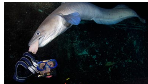
Havets Hus in Lysekil.

T he sea, the lakes and the archipelago all the way up to the Norwegian border offer fantastic bathing and great opportunities for sailing enthusiasts. Dalsland with its wilderness offers a variety of adventure activities for canoeists, anglers and climbers. Västra Götaland has more golf courses than anywhere else in Sweden and some are open all year round. Hikers can have their fill of beautiful trails, while cyclists can enjoy a family excursion or a demanding marathon.