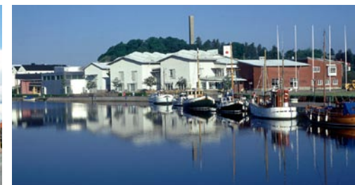
Bobusläns museum is located in the port area of Uddevalla and reflects life and nature in Bohuslän.