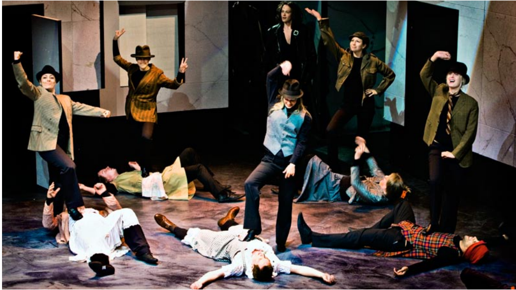
Students at the Academy of Music and Drama at the University of Gothenburg perform the opera Don Giovanni at the Artisten theatre.