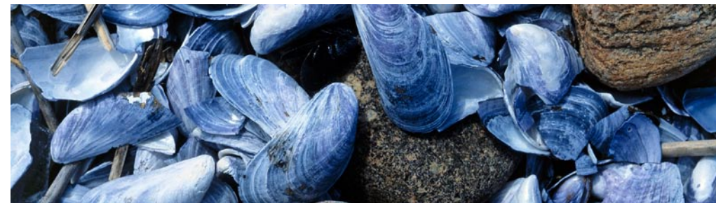
Sea mussels improve the marine environment and are the foundation for new food products from the west of Sweden such as mussel sausages and mussel pâté.