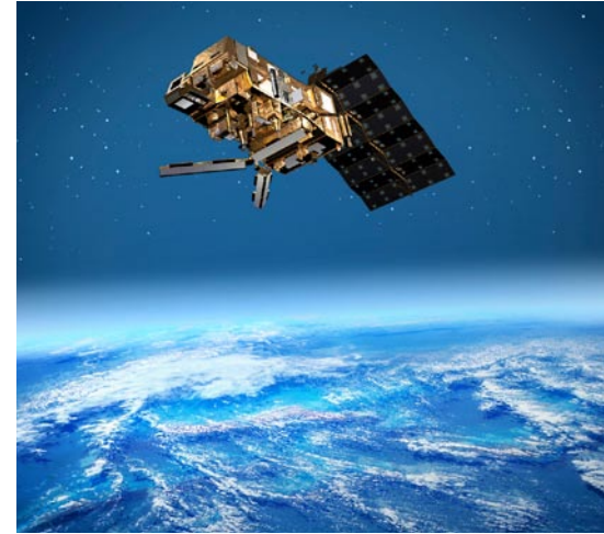
RUAG Aerospace Sweden in Göteborg develops products for the space industry with a focus on computer systems, aerals and microwave technology.

Information Technology is a strong industry in the west of Sweden, comprising some 4,700 companies. Lindholmen Science Park in Göteborg is one of Europe's largest IT centres. Here, universities and institutions of higher education cooperate with companies like Sigma, Semcon and Ericsson and 150 other small and medium-size cutting-edge enterprises. Västra Götaland is also home to companies with competence in microwave and aerial technology. For example, 40% of the world's microwave links are manufactured within a radius of 300 km. Ericsson develops radio links and radio base stations for mobile communication and Saab Microwave Systems is a leader in radar technology. Telematics, technology that integrates telecommunication and IT with traditional products