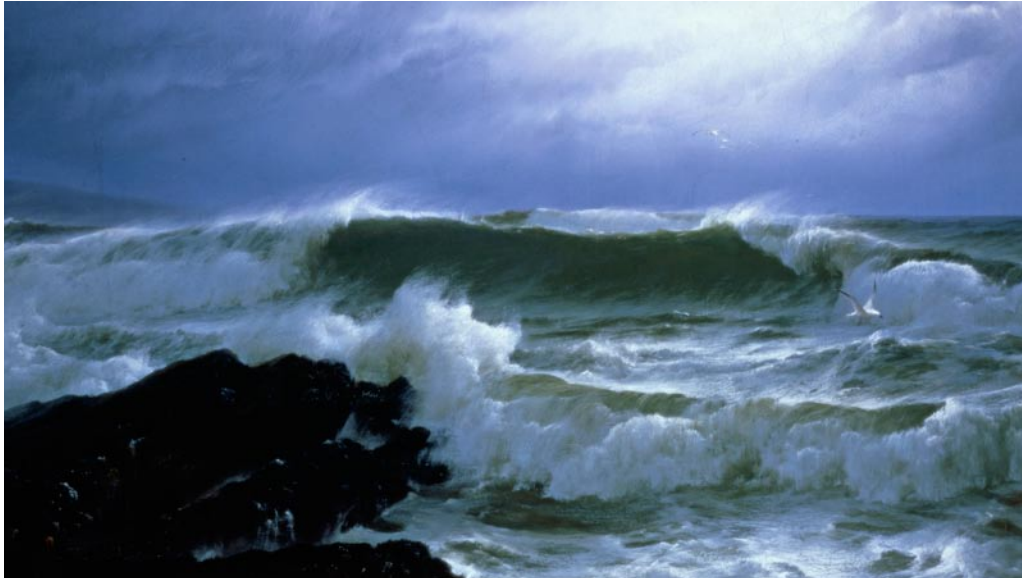
Systems for extracting energy from ocean waves are being developed outside Lysekil and there are plans to build a wave energy park.