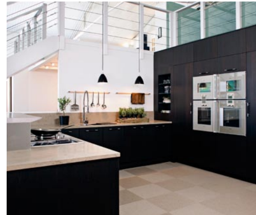
There are several major kitchen manufacturers in Västra Götaland, including Kvänum, Marbodal and Tibrokök.