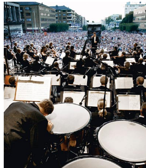
The Gothenburg Symphony Orchestra – the National Orchestra of Sweden – is one of Sweden's major orchestras and tours all over the world.

Västra Götaland is a Sweden in miniature, with large cities, rural areas, small communities and medium-sized towns. There is the sea, lakes, rolling hills, deep forests, open plains – all the different types of natural environment in Sweden except mountains. The countryside in Västra Götaland is very important for its citizens' recreation and visitors' experiences. It invites adventures in the wild, sailing and fishing and offers a great many exciting culinary experiences.