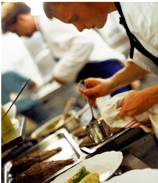
A food experience of the highest quality awaits diners at the approximately 30 restaurants certified in the Taste of West Sweden programme.