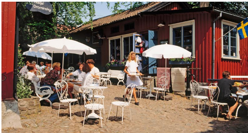
Café life in the timbered town of Alingsås.

Borås has a strong tradition in textiles and design and tomorrow's fashion designers are trained here. Shopping is a matter of course in a commercial centre like Borås and the city also attracts many families for a day out at Borås Zoo – a savannah in the heart of the “city of textiles”. Mölndal is part of the metropolitan area around Göteborg with exciting historical environments like Kvarnbyn and Gunnebo House and Gardens. The industrial city of Trollhättan's outstanding features are its location on the Göta Älv river and its falls and locks. There are many more small and medium-sized towns to discover, each with its own character and specialities.