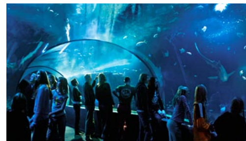
Universeum in Göteborg.