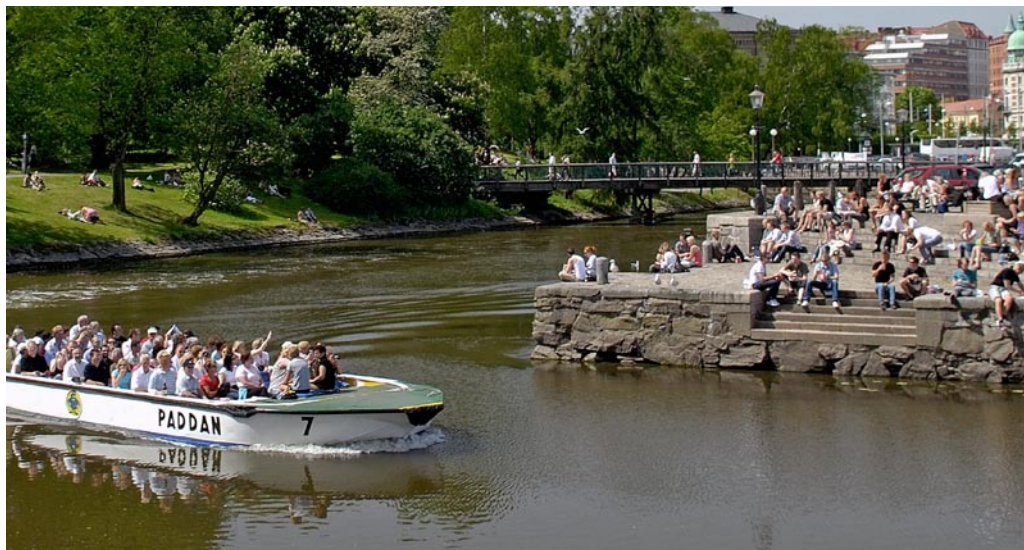
Göteborg, Sweden's second-largest city, offers a relaxed international atmosphere.