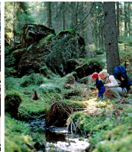
The best things in life can't be bought for money – the right of common access, unique to Sweden, entitles everyone to visit the countryside freely on nature's terms.

Its diversity is also reflected in the 1.6 million people who live here. 17% of Sweden's population live in Västra Götaland and approximately 130 nationalities are represented. Trade and industry in Västra Götaland is very varied and internationally oriented with a focus on research and development. Most people work in the service sector and more than one in four people in trade and industry are employees of foreign-owned companies.