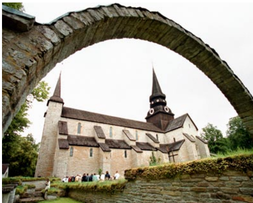
Varnhem Monastery Church from the 12th century plays an important role in the history of Sweden and the church.

The church contains royal tombs from the 13th century and Birger Jarl, the founder of Stockholm, is also buried here. In Skara there is a cathedral, the Museum of Västergötland with Bronze Age and medieval artefacts, and the Fornbyn open-air museum. Just outside Borås lies the renaissance manor Torpa Stenhus that dates back to the 1400s.