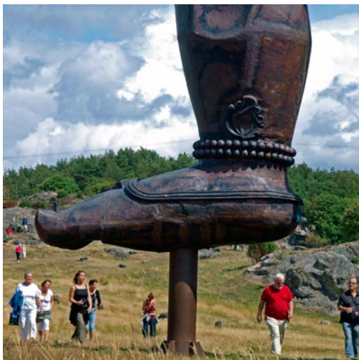
A sculpture at Pilane on the island of Tjörn – a contemporary art experience in an ancient landscape.