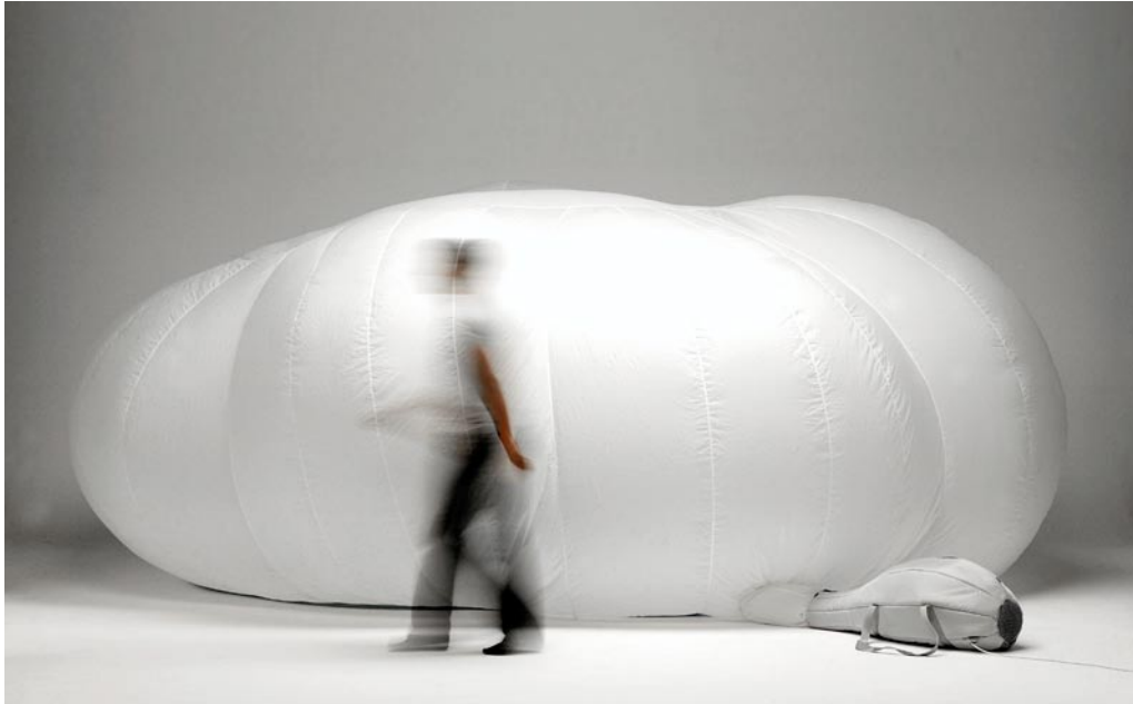
Internationally acclaimed Cloud is a portable room for rest, meetings and concentration – designed by Monica Förster and made by the OFFECCT furniture company in Tibro.