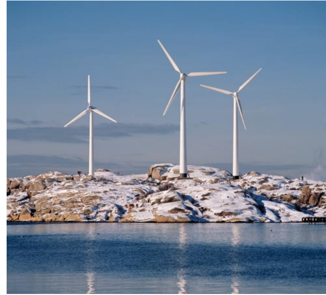
Wind power generation in Västra Götaland can increase 25-fold by 2020 – from today's 0.2 TWh to 5 TWh

One of Västra Götaland's environmental goals is to be practically independent of fossil energy by 2030. This is a great challenge but at the same time a business opportunity for both small and large entrepreneurs. Västra Götaland is home to most of Sweden's engineering, environmental and consumer research, successful companies in the energy and climate fields, industrial expertise and – not least – skilled, environment-conscious people.