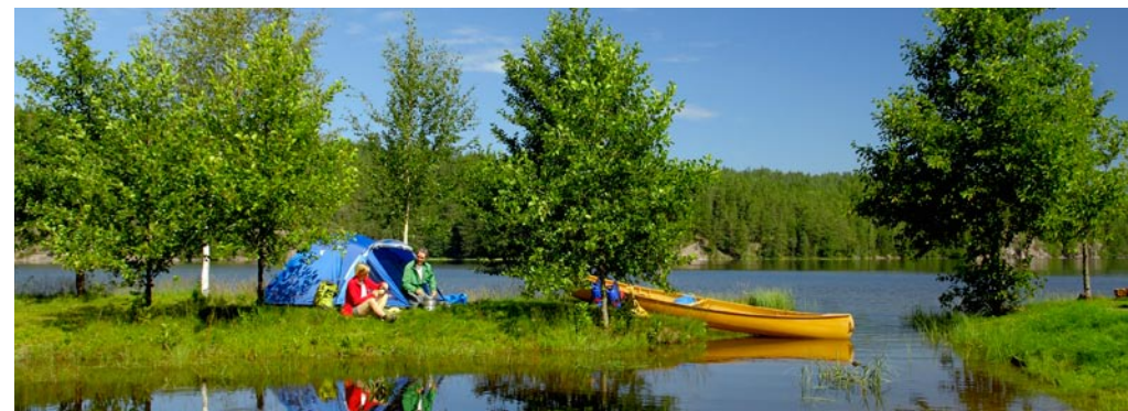
Canoeing in Dalsland, the province with the most waterways and lakes in Sweden.