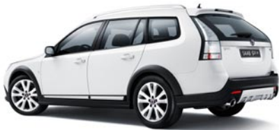
Saab BioPower 9-3X