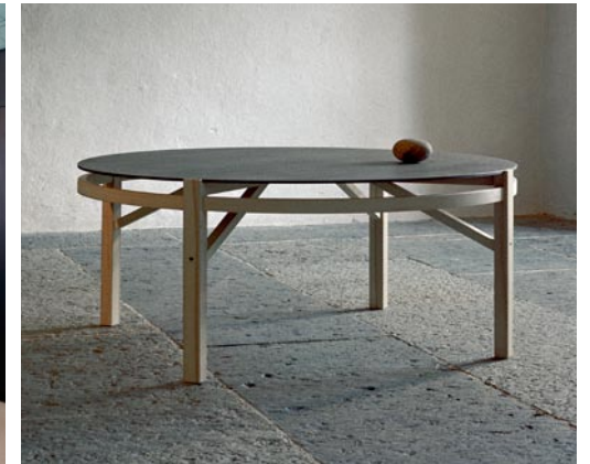
Olby Design in Skövde is one of many small furniture producers that combine traditional craftsmanship with modern design.