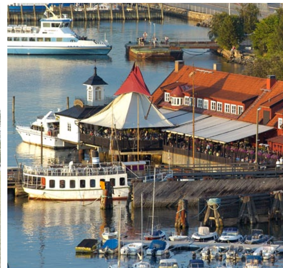
Sjömagasinet is one of the restaurants awarded a star in Guide Rouge.

park, with its Rose Garden and Palm House, is located right in the city centre.