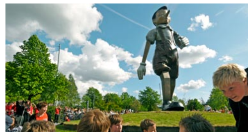
Jim Dine's "Walking to Borås" is one of the exhibits at the new sculpture park in Borås.