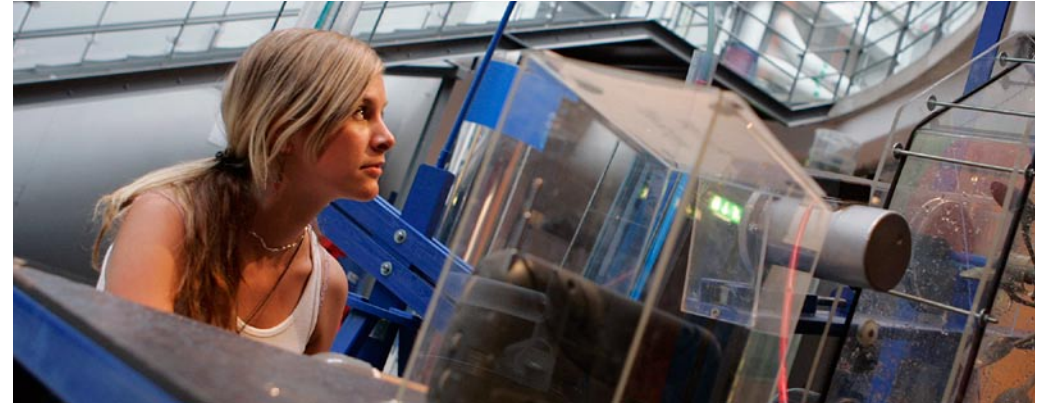
Tomorrow's production engineering under development at Innovatum Science Park.

T he automotive industry is one of the largest and most important industries in Västra Götaland. The Göteborg-Trollhättan-Uddevalla triangle contains four of Sweden's five vehicle manufacturers, constituting a concentration of knowledge, research resources and production expertise. Hundreds of suppliers whose operations are closely linked to the vehicle manufacturers are based in Västra Götaland. They include Autoliv in Vårgårda, a leader and pioneer in vehicle safety, that develops seat belts, airbags and whiplash protection systems. Most of the world's vehicle manufacturers are among Autoliv's customers.