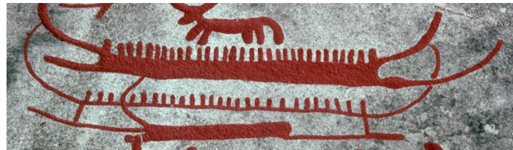
Bronze Age graffiti at Tanum – inscribed on UNESCO's World Heritage List since 1994.