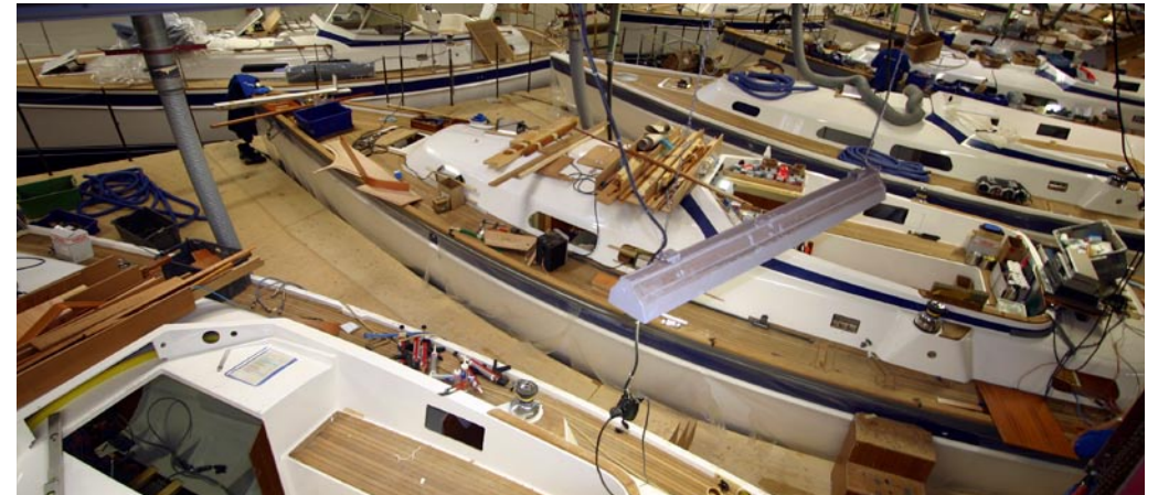
Hallberg-Rassy on Orust uses old boatbuilding techniques to produce exclusive long-distance yachts.

There is a strong boat-building tradition, particularly on Orust, with numerous yards that build yachts and motor boats. Volvo Penta is a world-leader in inboard engines and complete drive systems for all types of craft from leisure boats to commercial vessels and industrial engines. In order to develop the maritime industry and conduct research for environmentally sustainable shipping, industry and academia have set up several collaborative projects. Examples include Lighthouse at Chalmers University of Technology in Göteborg and the Swedish Marine Technology Forum in Uddevalla. Clean Shipping Project is another collaborative project that aims to stimulate shipping companies and transport purchasers to introduce more new environmental technology in their vessels.