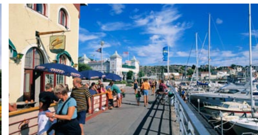
Strömstad is Västra Götaland's northernmost town, with the Koster islands spread out to the west.