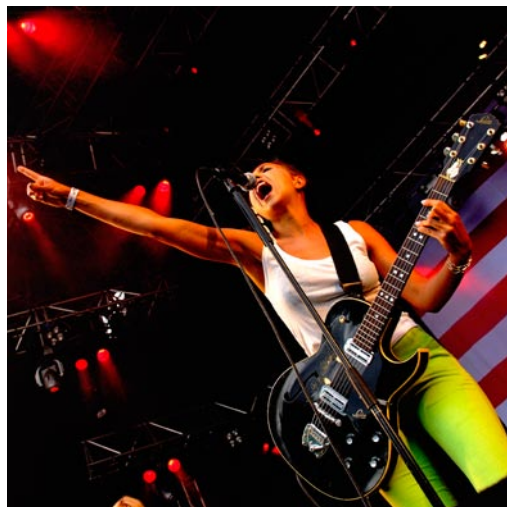
The Way Out West music festival in Slottsskogen in Göteborg.