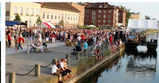
On the edge of Lake Vänern lies Vänersborg, the seat of the Regional Council.