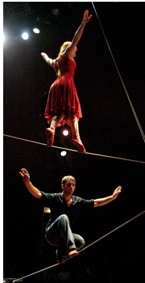
Göteborg Dance & Theatre Festival.

The many festivals cover most kinds of cultural expression and culminate in the summer when festivals are held almost everywhere in Västra Götaland.